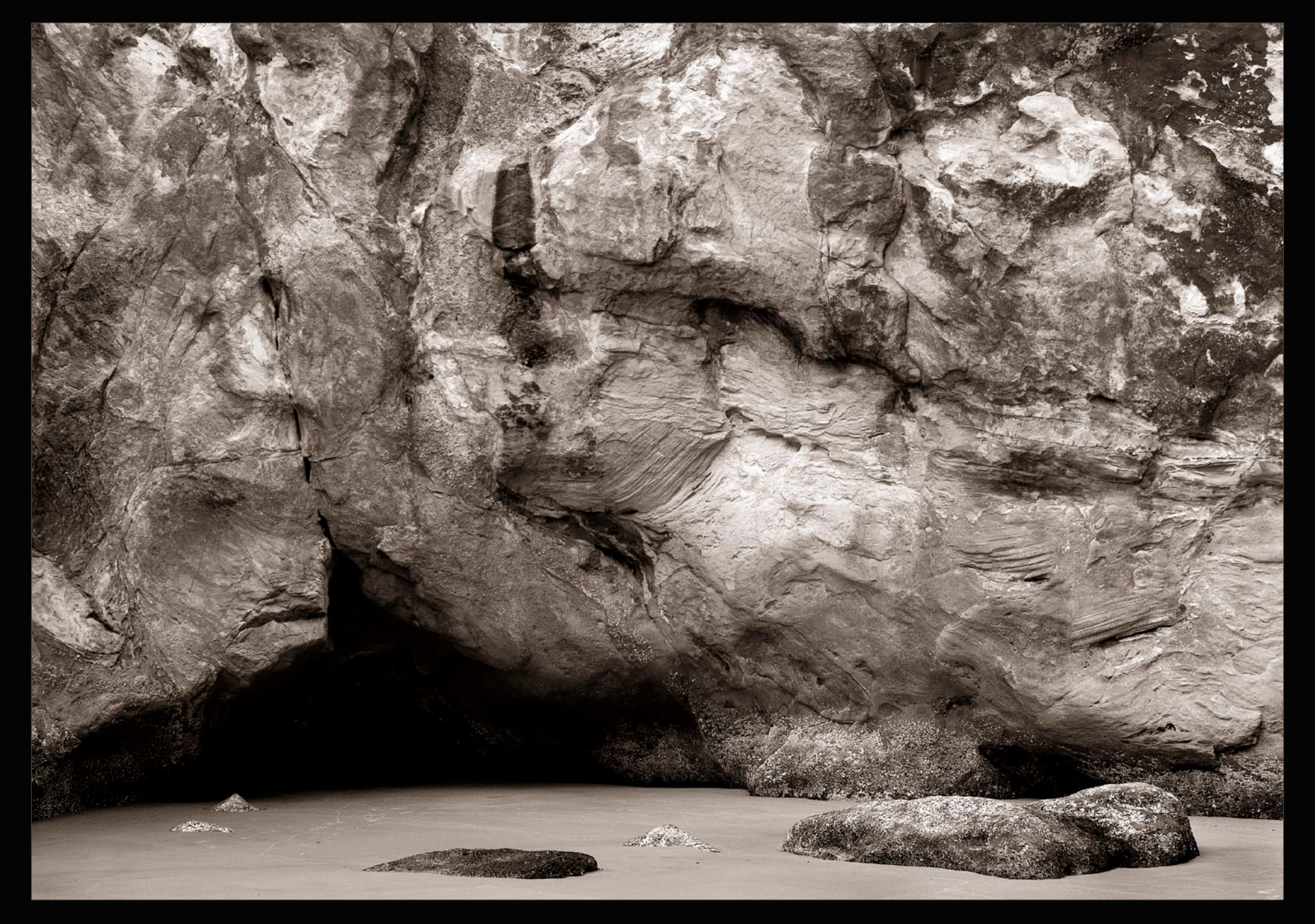
Rock Wall & Cave, Hug Point