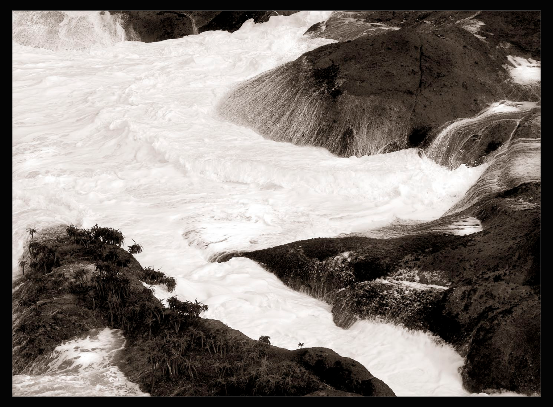
Sea Palms & Surf, Rocky Creek Wayside