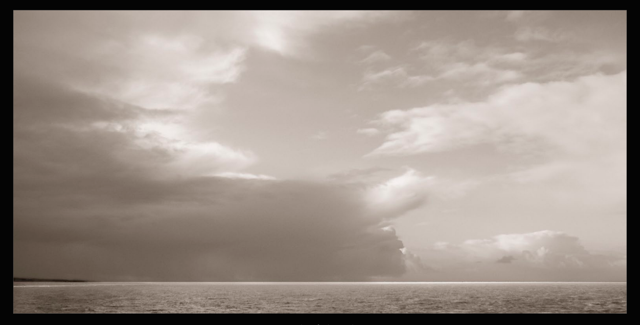
Yaquina Seas & Storm Clouds