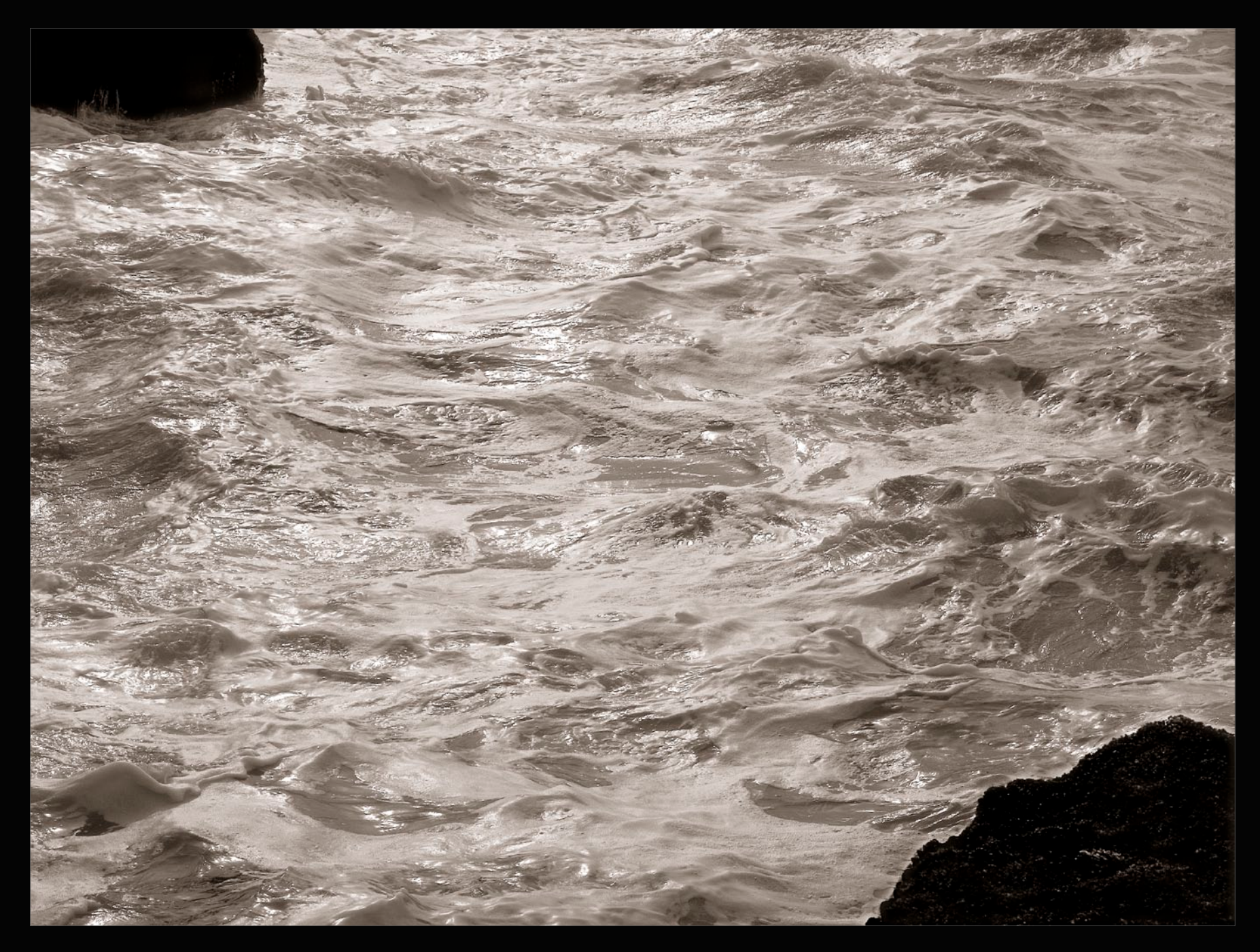
Cape Perpetua #18