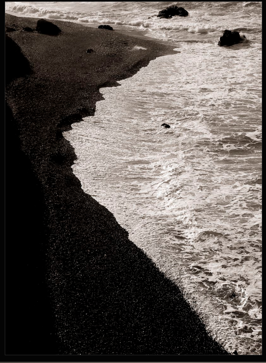
Yaquina Head Rocks and Shoreline #25