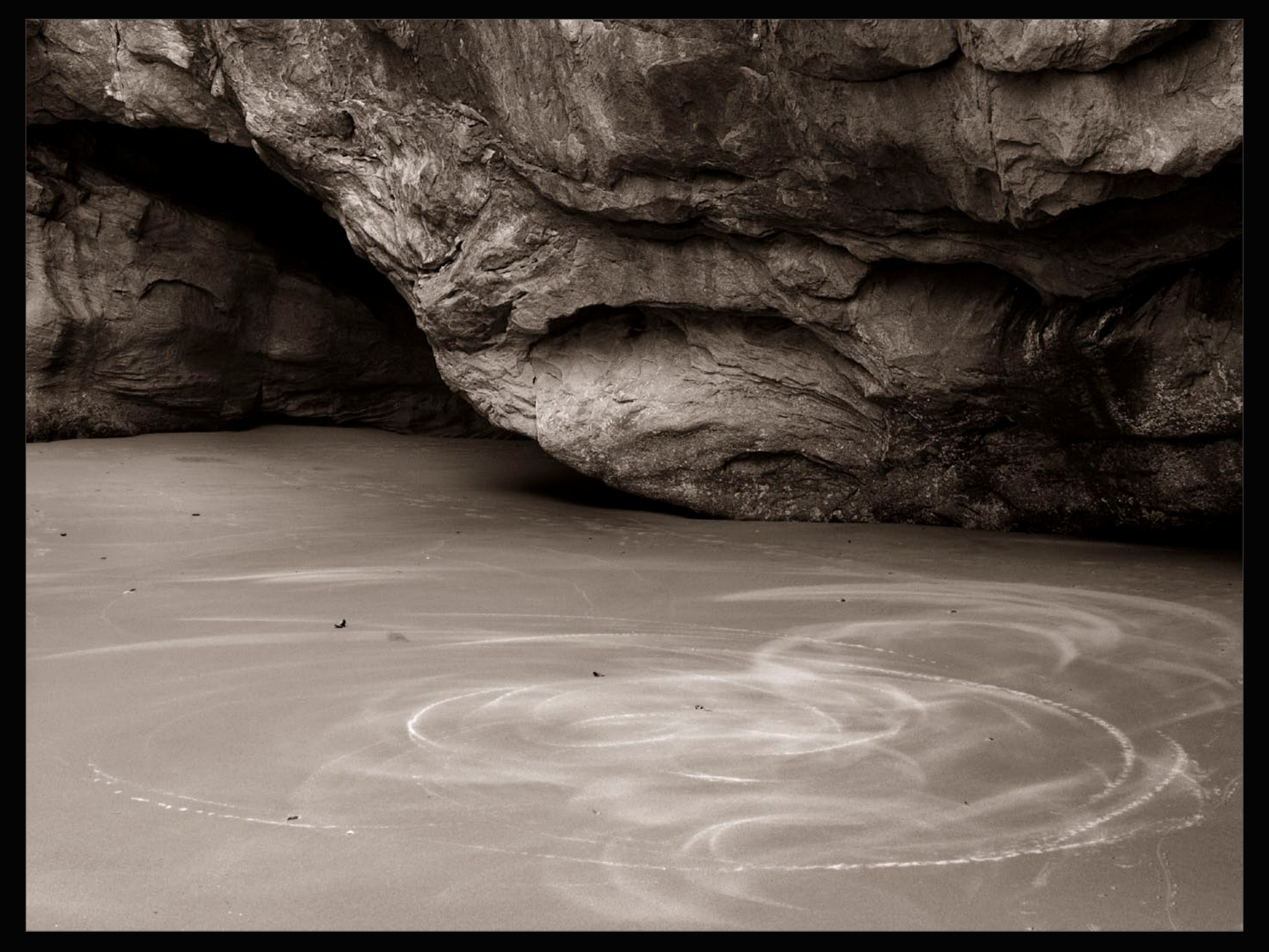
Rock Wall & Wind Tracings, Hug Point