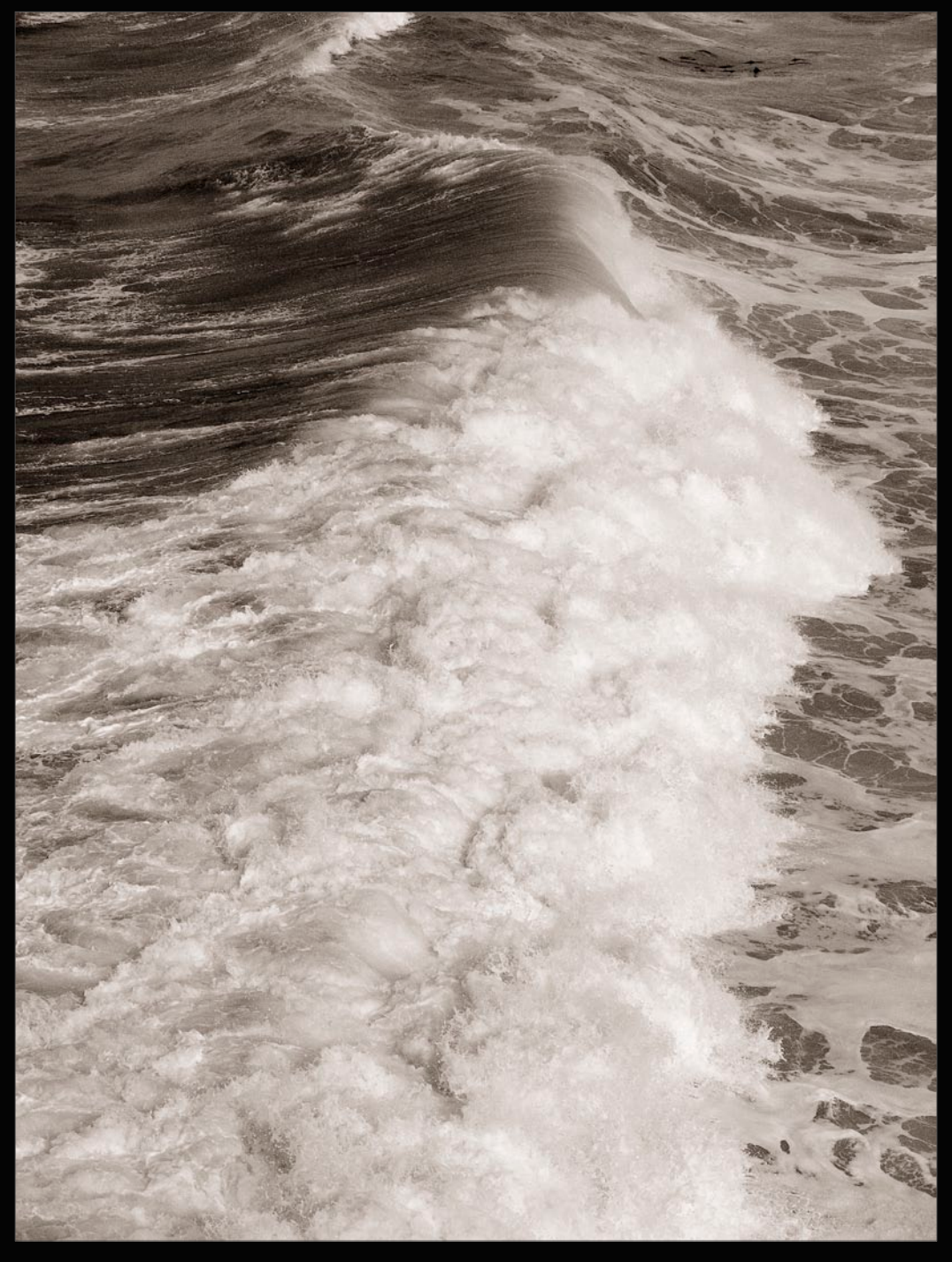
Surf, Depoe Bay