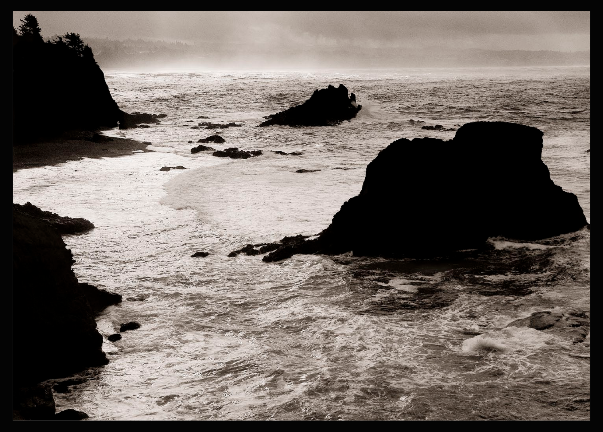
Yaquina Head Rocks and Shoreline #37