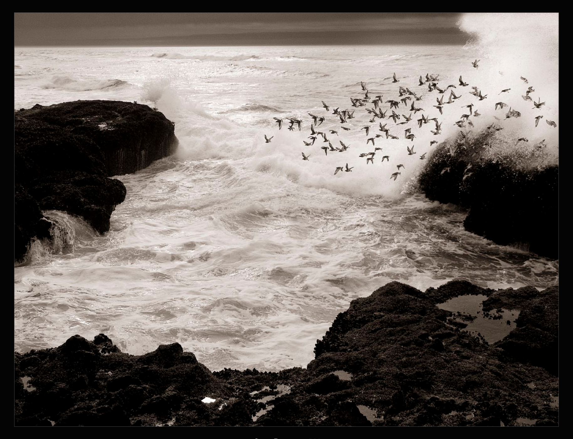
Cape Perpetua #32