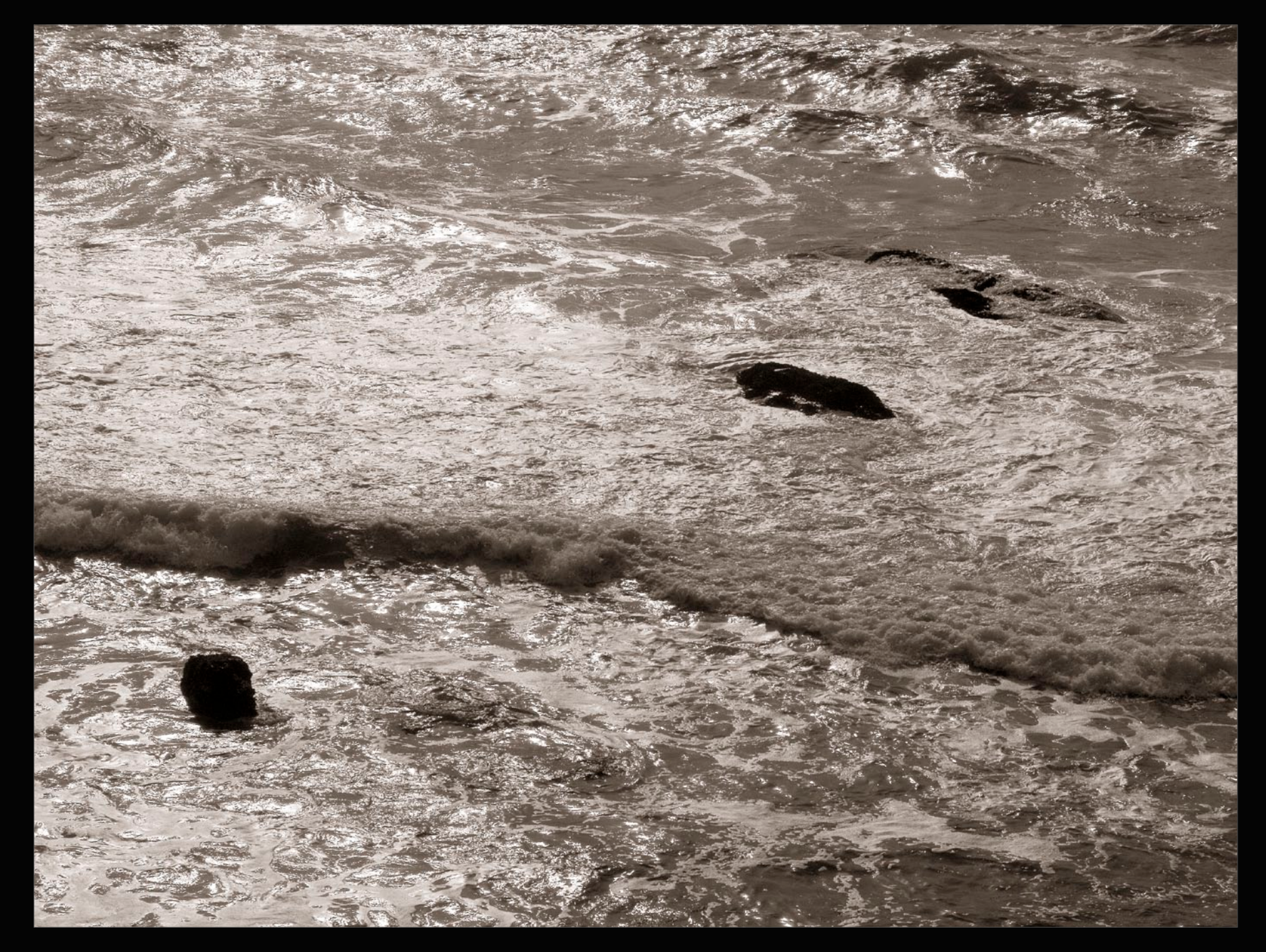
Yaquina Head Rocks and Shoreline #68